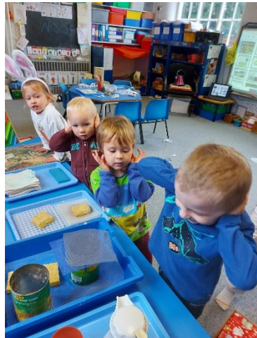
Squirrels had fun making paper and playing in the snow over recent weeks.